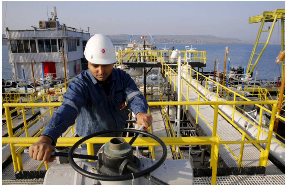
A worker checks the valve gears of pipes linked to oil tanks at Turkey's Mediterranean port of Ceyhan.

Significantly, Kurdistan's oil sector recovery received a major boost by the entry of Russian state oil firm Rosneft. In early 2017, Rosneft began committing billions of