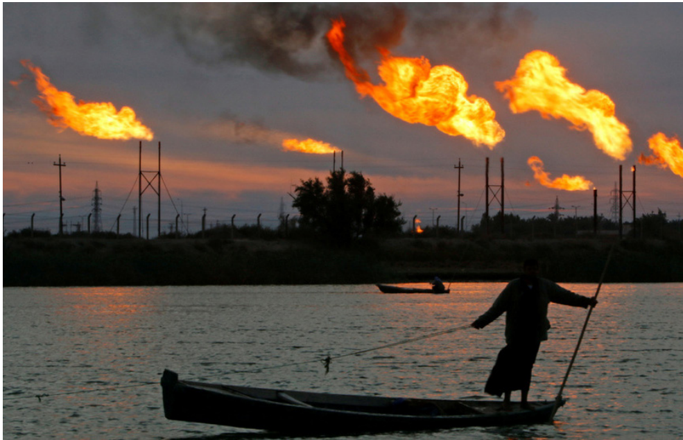
Flames emerge from flare stacks at the oil fields in Basra, Jan. 17, 2017.