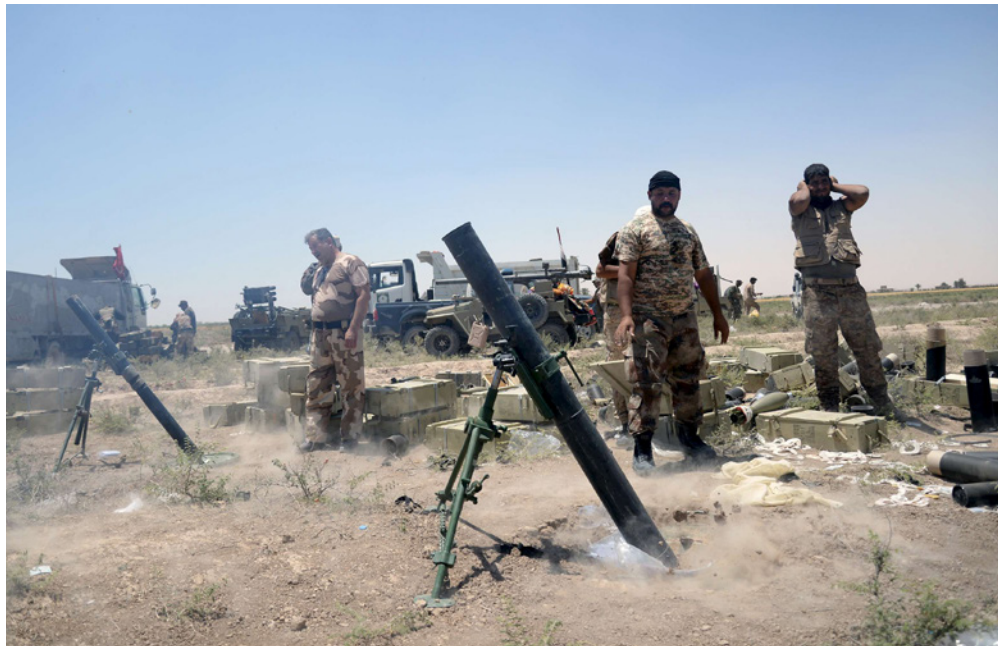
Paramilitary troops operating under the Iraqi government's al-Hashid al-Shabi program launch a mortar toward Islamic State militants north of Fallujah on July 6, 2015.

Syrian Democratic Forces (SDF) had created something of a buffer zone in eastern Syria between the Euphrates River and the Iraqi border, but in late October the Turk-