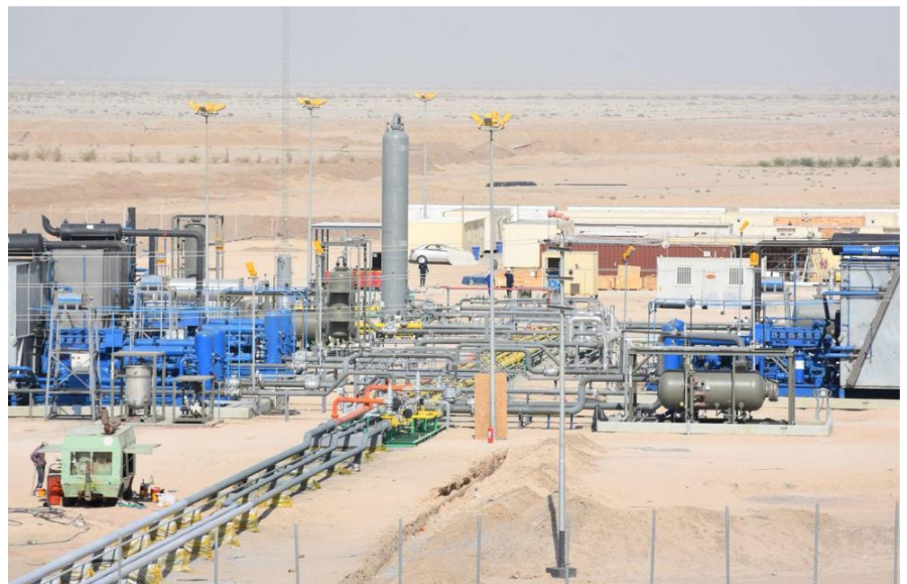
The Nassiriya oil field's associated gas treatment facility on Sept. 27, 2018.

Oklany in his presentation said that in 2021, BGC will handle an estimated 1.4 billion scf/d of Rumaila, West Qurna 1 and Zubair fields' associated gas. The contractual capacity target of BGC is 2 billion scf/d.